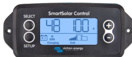
SmartSolar pluggable display

Simply remove the rubber seal that protects the plug on the front of the controller, and plug-in the display.