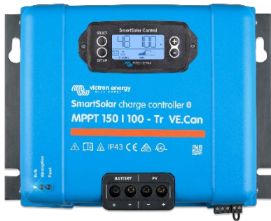
SmartSolar Charge Controller MPPT 150/100-Tr VE.Can with optional pluggable display