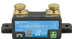
Bluetooth sensing: SmartShunt