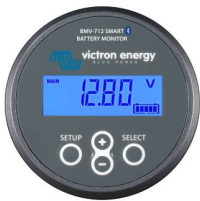
Bluetooth sensing BMW-712 Smart Battery Monitor