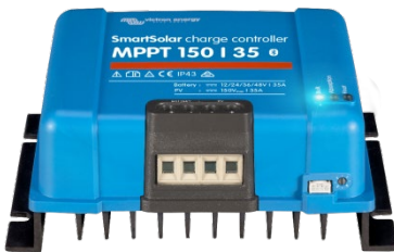
SmartSolar Charge Controller MPPT 150/35