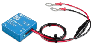
Bluetooth sensing Smart Battery Sense