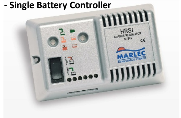
Product 130 x 80 x 42 mm 185g Packaged 160 x 110 x 60 mm 255 g