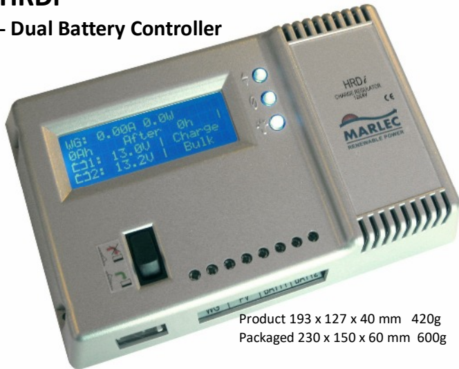
Product 193 x 127 x 40 mm 420g Packaged 230 x 150 x 60 mm 600g