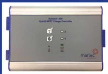
Dims: 258x164x68mm 1.3kg 10x6½x2¾ 2.9lbs