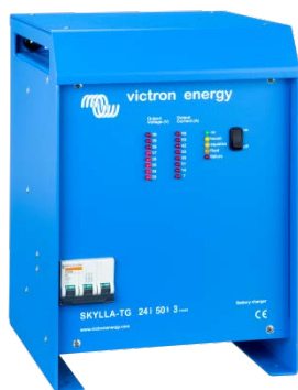
Skylla TG 24 50 3 phase

To learn more about batteries and charging batteries, please refer to our book 'Energy Unlimited' (available free of charge from Victron Energy and downloadable from www.victronenergy.com ).