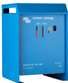
Skylla TG 24 100