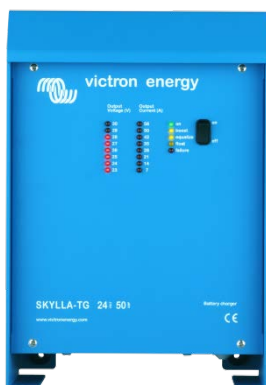
Skylla TG 24 50